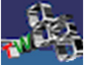
Award winning systems for fast moving businesses

AXLR8's system is hosted and hence avoids the cost of in-house servers and integrates easily with the websites of both Tristan Bates Theatre and The Actors Centre. The Actors Centre staff can book the courses and performances with their venues and rooms on the system, preventing clashes. Each event and session can be templated. That means, if you run a similar one, you do not have to re enter all the details. Just "clone" it for another date or build on it. Likewise, if you update a tutor's details, all courses where that tutor is teaching will be updated. Change the venue and the website will present the new location.