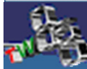
Award winning systems for fast moving businesses