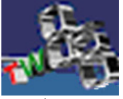
Award winning systems for fast moving businesses